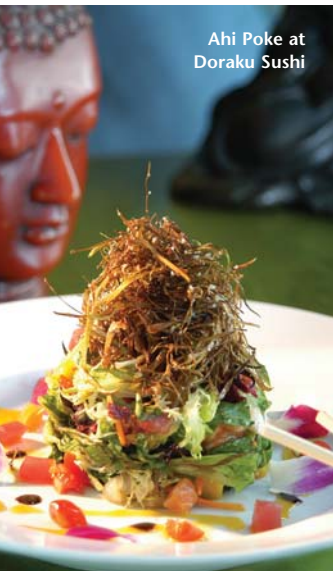
Ahi Poke at Doraku Sushi

Just outside of Waikiki, over the Ala Wai canal, sits Leonard's Bakery , a Honolulu staple among locals and visitors alike. Founded in 1952, Leonard's is most famous for its malasadas—fluffy Portuguese donuts that are crispy on the outside and light as air inside. Though you may wait in a line to place your order, your taste buds will thank you. leonardshawaii.com