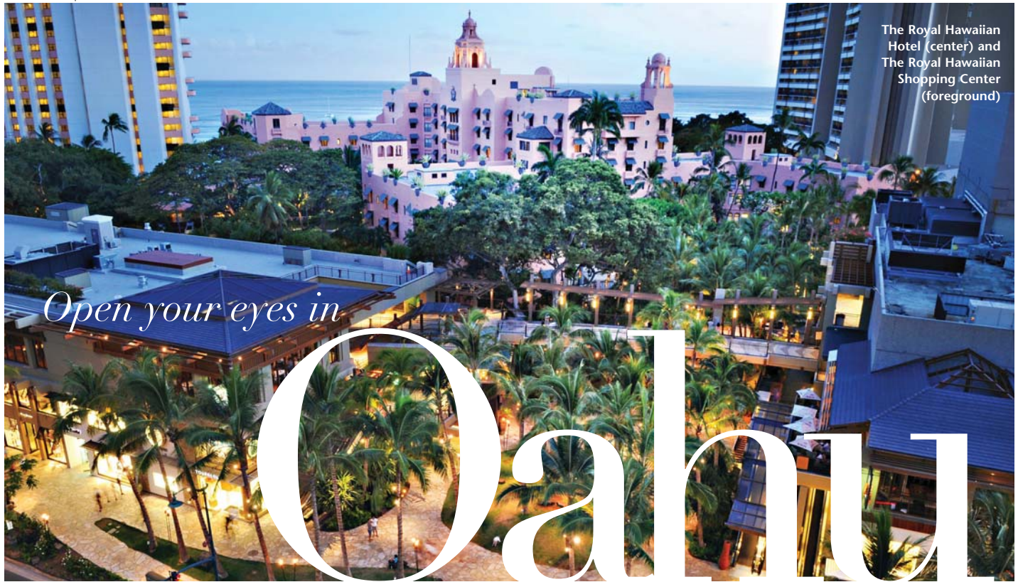
The Royal Hawaiian Hotel (center) and The Royal Hawaiian Shopping Center (foreground)